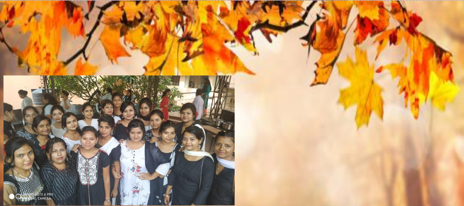
Visit to CIF Lab, OUAT